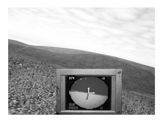
Fig. 2 Horizon image classified into sky and ground

The complexity of the computation needed to perform these calculations is relatively low. Each pixel value is processed once to calculate the histogram, then once to calculate the blueness value and the binary segmentation. Each pixel in the binary image is processed once to calculate the centroids. The horizon angle calculation then uses the two centroids only. If the image has N pixels, the computational complexity is of order 3N at worst. This can be reduced by computing the image histogram and binarisation threshold less often.